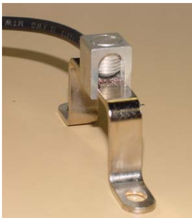
Figure #1 Tin Plated Aluminum Connection Blocked with lead wire

The #10-32 threaded hex nuts on the individual element terminals need to be tightened to 20 inch/pounds.