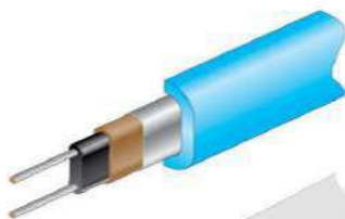
Foiled heater shown with non-insulated capping

Specially designed spring clips hold the heater and the channel, or angle, to the rail. A range of clips are available to suit a variety of different rail profiles.