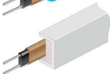
Unfoiled heater shown with insulated capping

HTUK Ltd, Alexandra Building Wearfield Sunderland SR5 2TA, England