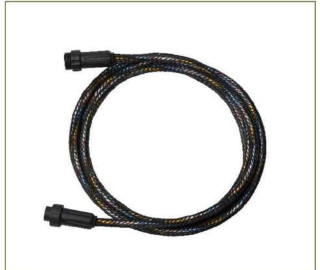
Photos and illustrations are not contractually binding and are subject to change without notice

The sensor cable contains all the wiring necessary for long-range applications and for the connection in series of several sensors to the same approved monitoring module. The